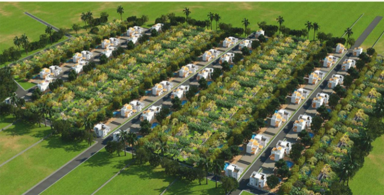
Aerial View - Hyderabad Project