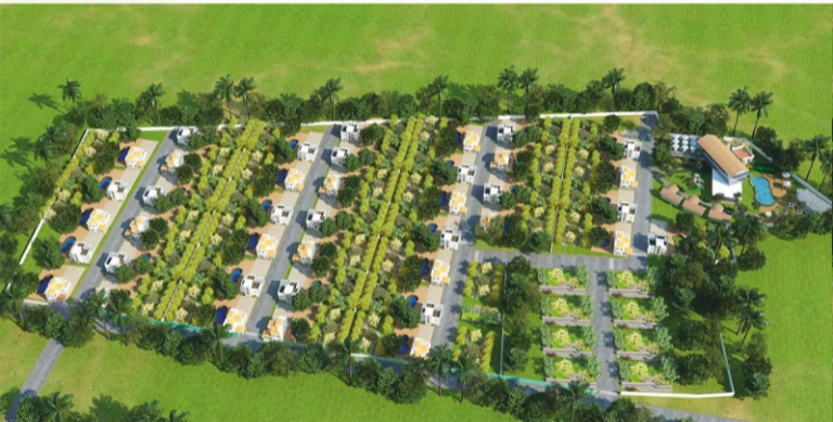
Aerial View - Chennai Project