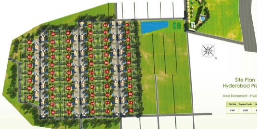
Site Plan Hyderabad Project