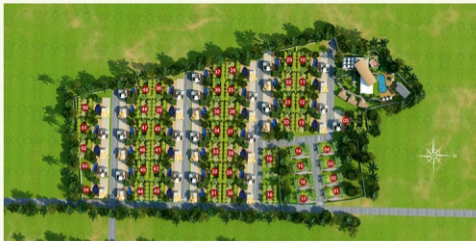
Area Statement - Chennai